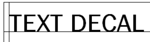
Layout lines when decal should be aligned on the left.